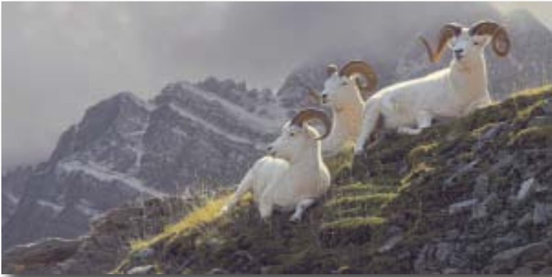
SUMMIT SANCTUARY Fine Art Giclée Canvas: limited to 75 s/n. 34" w x 17" h. $695