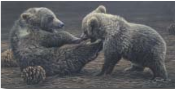
BRAWLIN' BRUINS Fine Art SmallWorks™ Giclée Canvas: limited to 100 s/n. 16" w x 8" h. $200