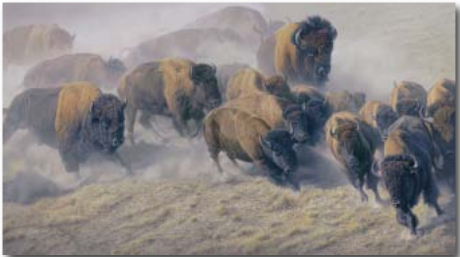
THUNDER AND DUST

Fine Art SmallWorks™ Giclée Canvas: limited to 100 s/n. 10" w x 10" h. $210