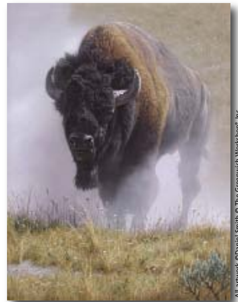
OUT OF THE DUST Fine Art SmallWorks™ Giclée Canvas: limitd to 200 s/n. 9" w x 12" h. $225

All artwork © Daniel Smith © The Greenwich Workshop, Inc.