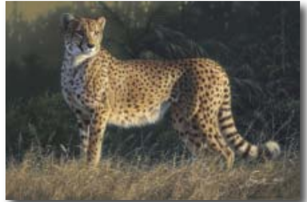
DUMA Fine Art SmallWorks™ Giclée Canvas: 100 s/n. 12" w x 8" h. $200