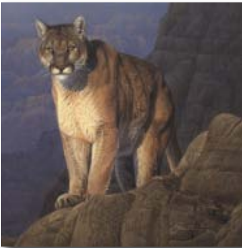
INTO THE SUN

Fine Art Giclée Canvas: limited to 125 s/n. 18" w x 21" h. $595