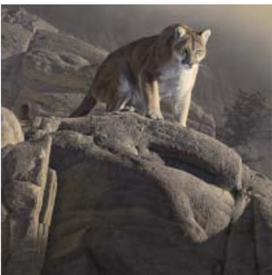
ON THE EDGE

Fine Art SmallWorks™ Giclée Canvas: Sold Out at Publisher. Ask Your Dealer for Availability.