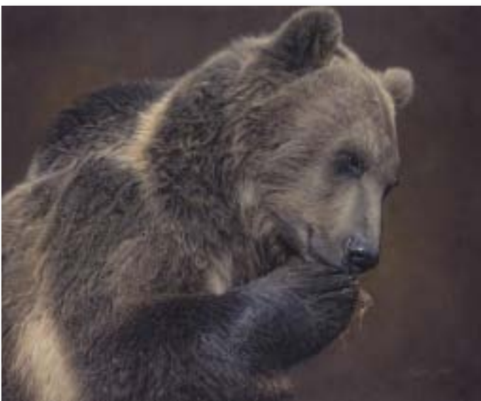
A NOSE FOR HONEY

Fine Art MasterWork™ Giclée Canvas: Sold Out at Publisher. Ask Your Dealer for Availability.