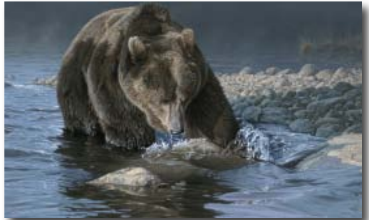
OVER THE RAINBOW Fine Art Giclée Canvas: limited to 100 s/n. 27" w x 17" h. $595