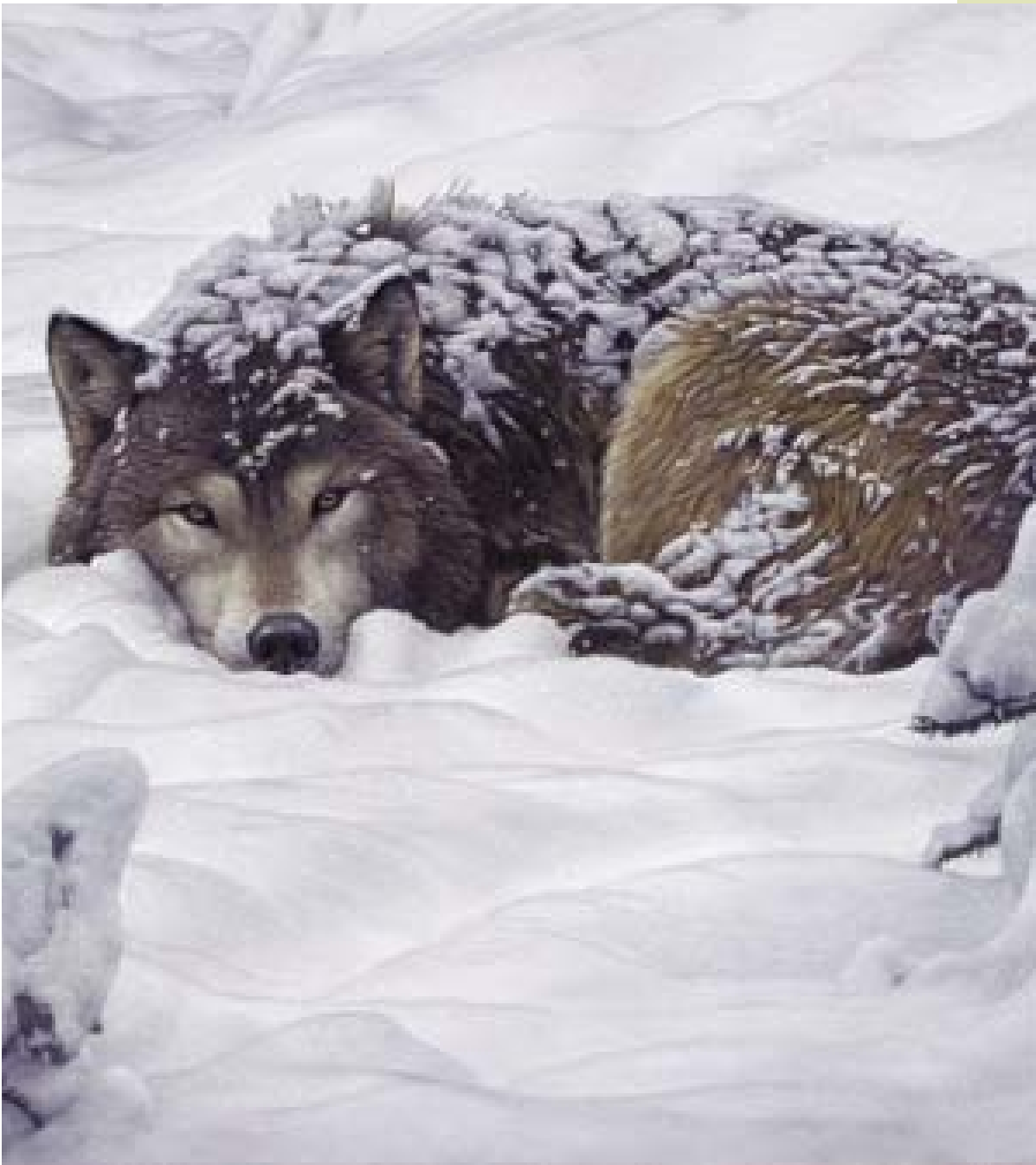
RIVERBANK REFLECTIONS (detail)