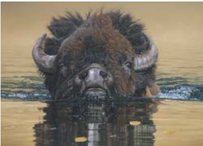
STILLWATER CROSSING Fine Art Giclée Canvas: limited to 50 s/n. 25" w x 18" h. $595 Low inventory Fine Art Giclée Print: limited to 100 s/n. 19 3/4" w x 14" h. $195