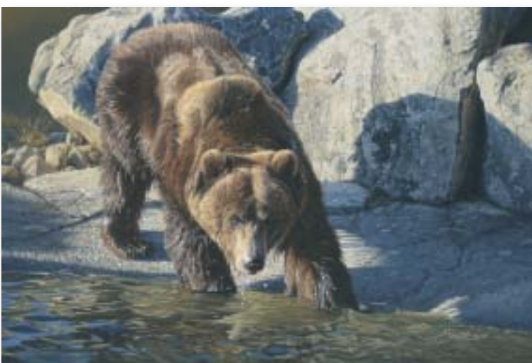
RETREAT FROM THE HEAT

Fine Art Giclée Canvas: limited to 200 s/n. 10" w x 9" h. $195