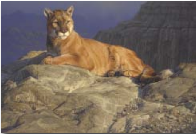
FLEETING SUN Fine Art Giclée Canvas: limited to 50 s/n. 24" w x 16" h. $595