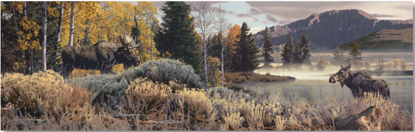
LOVE IS IN THE AIR Fine Art MasterWork™ Giclée Canvas: limited to 75 s/n. 41" w x 13" h. $695