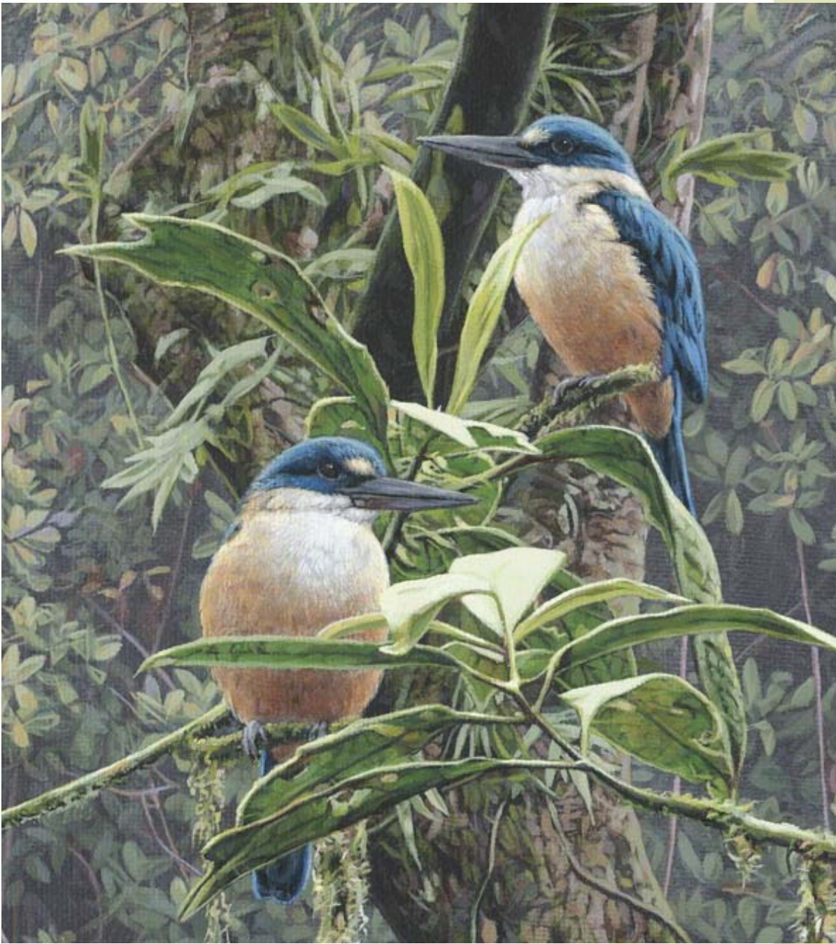
DOUBLE TEAM (detail)

All artwork ©Rod Frederick ©The Greenwich Workshop, Inc.