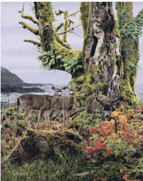
AUTUMN FRONT Fine Art Giclée Canvas: limited to 75 s/n. 20" w x 26" h. $695