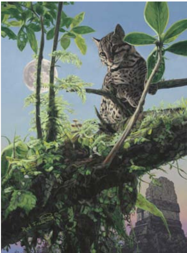
MOONLIGHTING Fine Art SmallWorks™ Giclée Canvas: limited to 75 s/n. 9" w x 12" h. $195