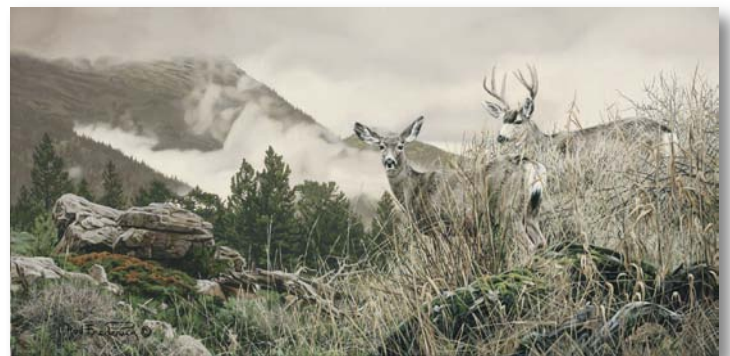
THE DRY SIDE OF WINTER

Fine Art MasterWork™ Giclée Canvas: limited to 100 s/n. 40"w x 21"h. $950