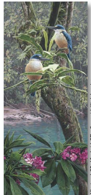
DOUBLE TEAM Fine Art SmallWorks™ Giclée Canvas: limited to 75 s/n. 8" w x 18" h. $245