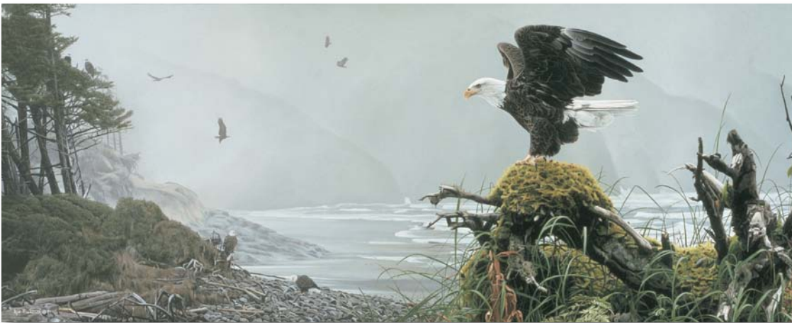
COMING HOME Fine Art Giclée Canvas: limited to 75 s/n. 36" w x 14" h. $625