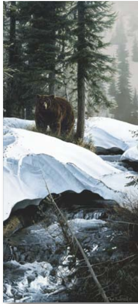
IN TALL TIMBER Fine Art Giclée Canvas: limited to 75 s/n. 18" w x 28" h. $525