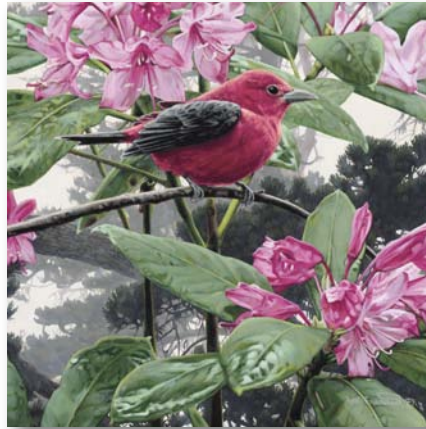
SCARLET TANAGER Fine Art SmallWorks™ Giclée Canvas: limited to 75 s/n. 8" w x 8" h. $175