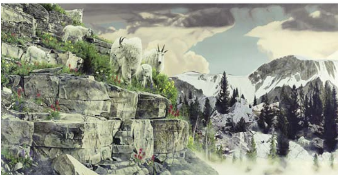
ON THE ROCKS