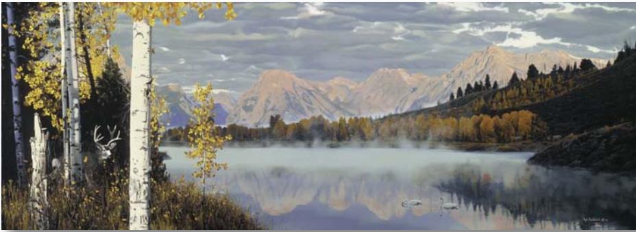
POINT OF VIEW

Fine Art Print: limited to 1000 s/n. 42"w x 15"h. $235 Low inventory