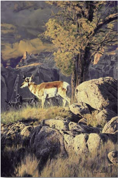
ON THE CANYON RIM Fine Art Giclée Canvas: limited to 75 s/n. 20" w x 30" h. $750 Low inventory