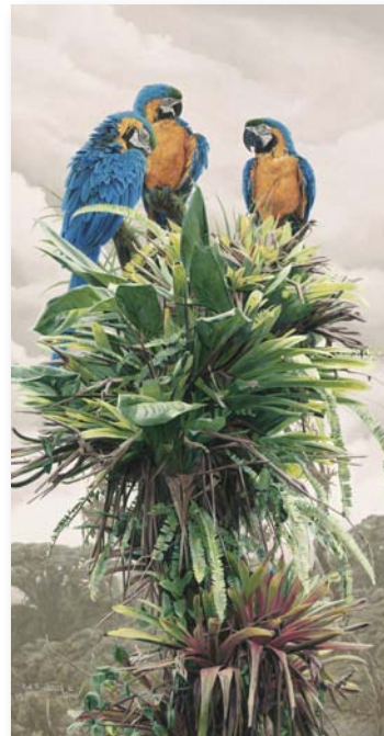
THE THREE AMIGOS Fine Art Giclée Canvas: limited to 75 s/n. 13" w x 24" h. $475

All artwork ©Rod Frederick ©The Greenwicks Workshop, Inc.