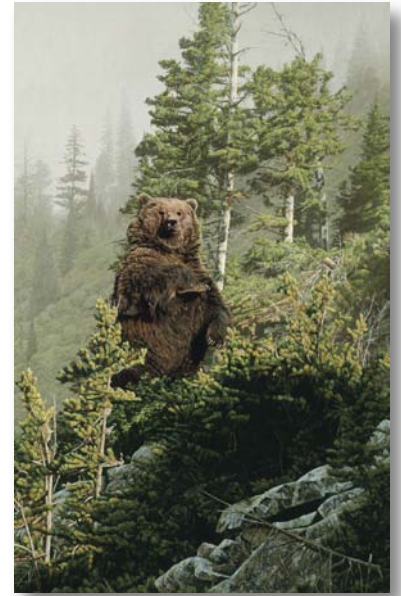
BARELY SPRING Fine Art Anniversary Giclée Canvas: edition not to exceed 75 s/n. 12" w x 26" h. $495