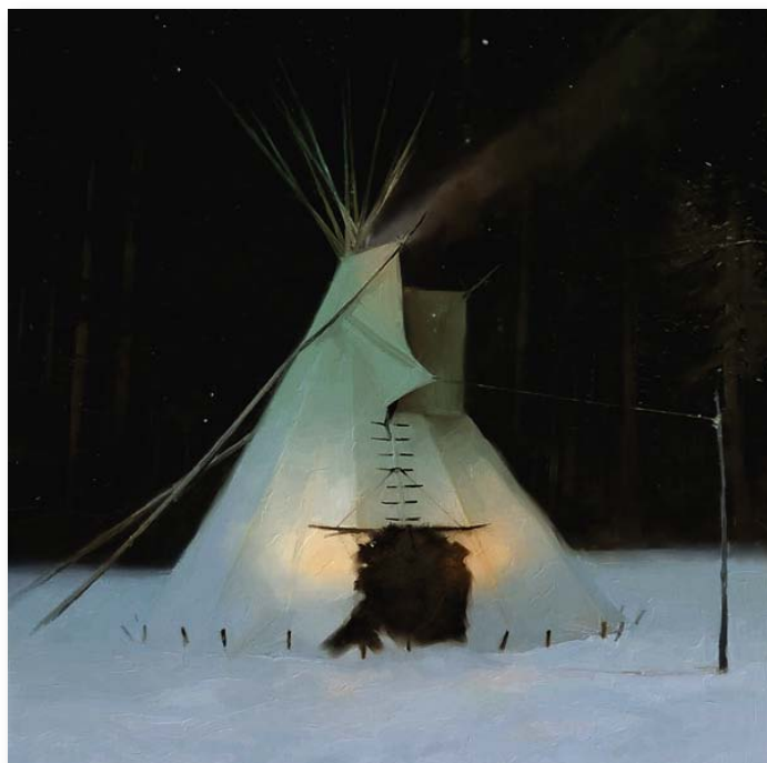
EARLY SNOW Fine Art Giclée Canvas: limited to 45 s/n. 20" w x 20" h. $450