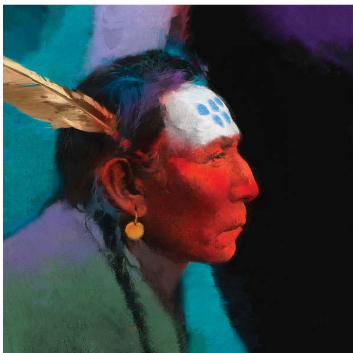
TWO GUNS Fine Art Giclée Canvas: limited to 25 s/n. 28" w x 28" h. $845