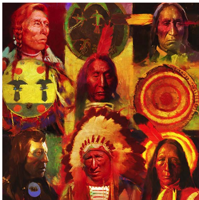
MEN AT ARMS Fine Art Giclée Canvas: limited to 25 s/n. 28" w x 28" h. $845

All artwork ©R. Tom Gilleon ©The Greenwich Workshop, Inc.