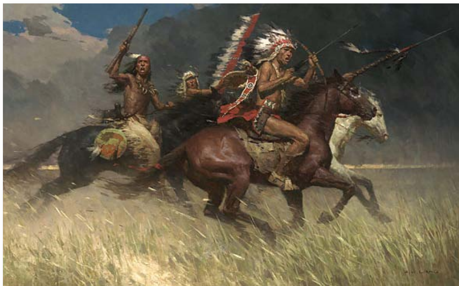
CIRCLING THE ENEMY