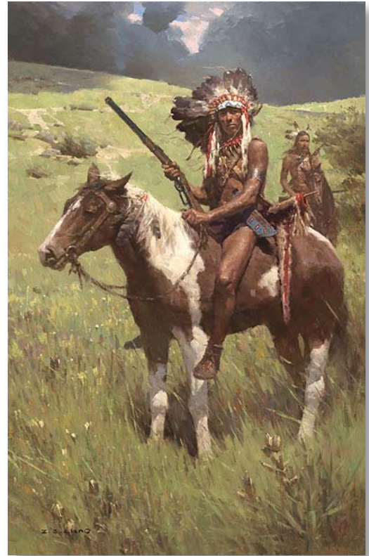
LITTLE BIG HORN, JUNE 25, 1876