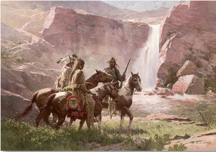
RED ROCK CROSSING, NORTHWEST MONTANA, 1850