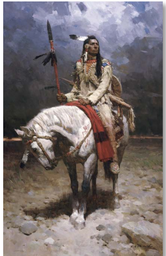
PRIDE OF THE PIEGAN

For more fine art by Z.S. Liang visit: www.greenwichworkshop.com/liang