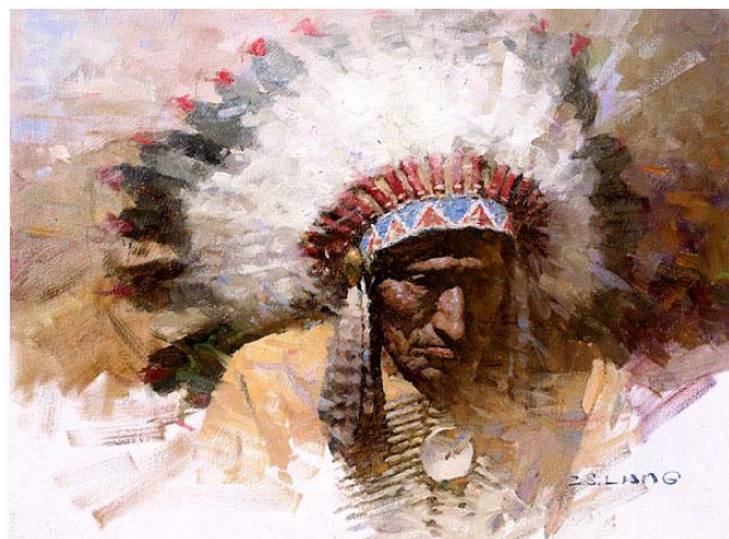
OLD CHIEF'S STORY