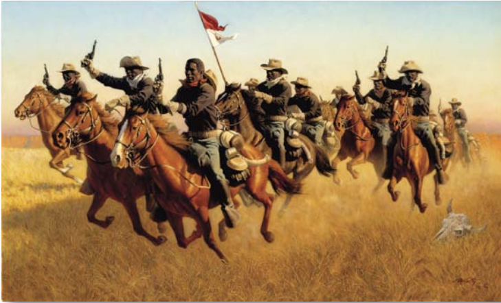
BUFFALO SOLDIERS: "ADVANCE AS SKIRMISHERS; CHARGE!" Fine Art Print: limited to 1500 s/n. 30" w x 18" h. $225 Low inventory