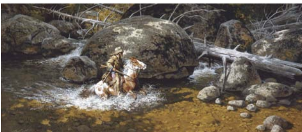
COVERING HIS TRAIL Fine Art SmallWorks™ Giclée Canvas: limited to 75 numbered. 19" w x 8" h. $245