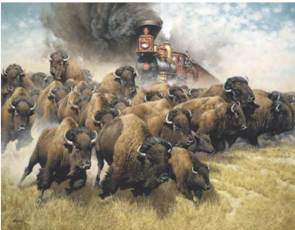
THE COMING OF THE IRON HORSE Fine Art Anniversary Giclée Canvas: edition not to exceed 75 numbered. 28" w x 22" h. $795