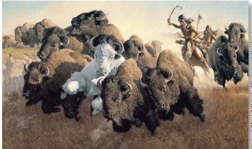
IN PURSUIT OF THE WHITE BUFFALO Fine Art Anniversary Giclée Canvas: edition not to exceed 75 numbered. 34" w x 20" h. $795