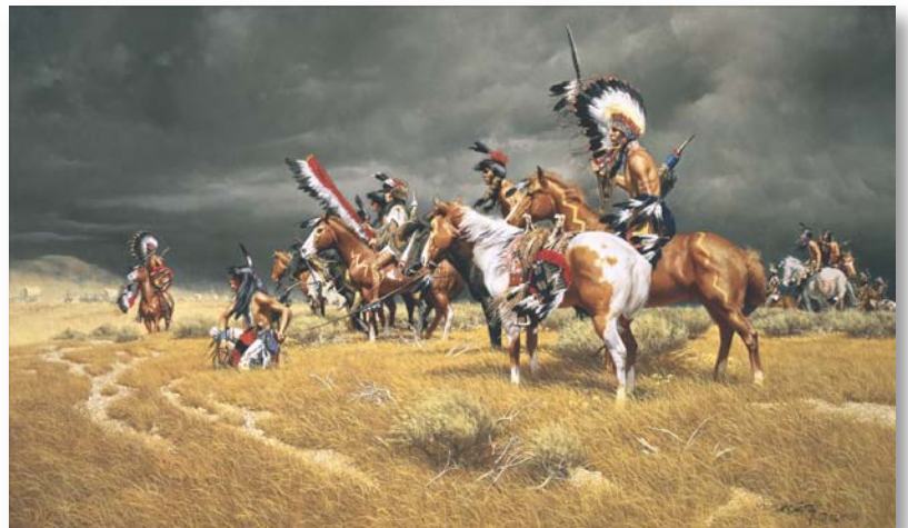
WATCHING THE WAGONS Fine Art Anniversary Giclée Canvas: edition not to exceed 75 numbered. 30" w x 18" h. $695