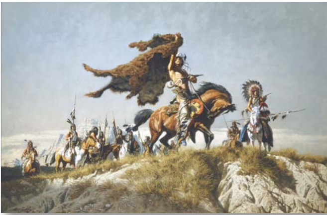
BUFFALO ROBE SIGNAL Fine Art Giclée Canvas: limited to 75 numbered. 29" w x 19" h. $625

Fine Art Anniversary Giclée Canvas: edition not to exceed 75 numbered. 32" w x 17" h. $695