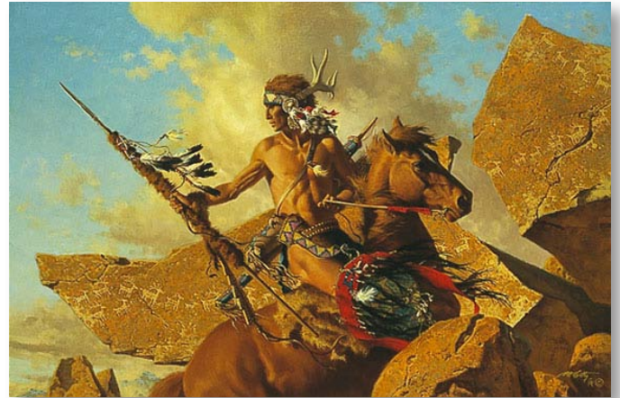
THE WAY OF THE ANCIENT MIGRATION Fine Art Print: limited to 1250 s/n. 27" w x 18" h. $245 Low inventory