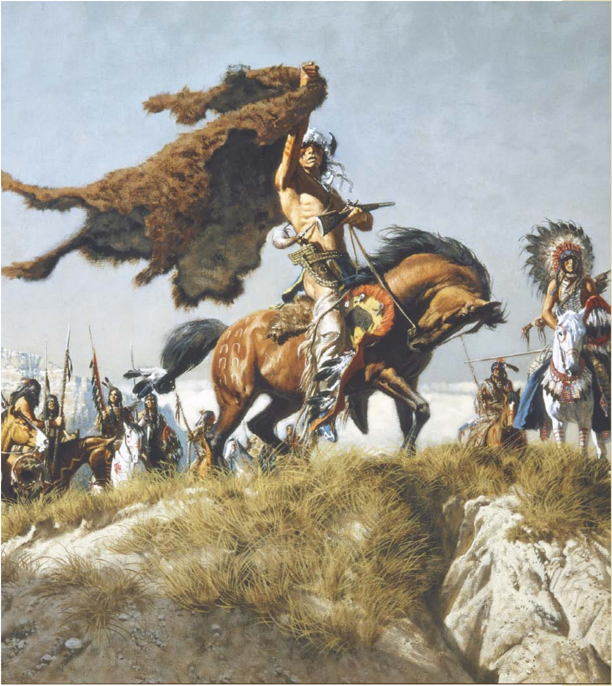
BUFFALO ROBE SIGNAL (detail)