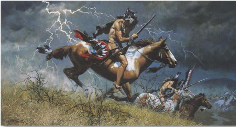
WHEN OMENS TURN BAD

Fine Art Anniversary Giclée Canvas: edition not to exceed 75 numbered. 32" w x 17" h. $695