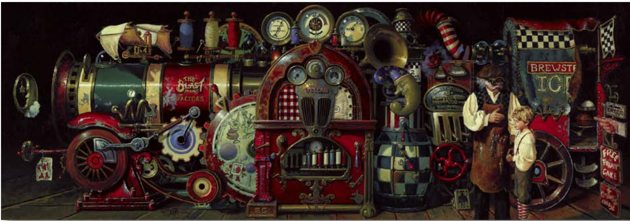
THE MONSTER LAUNCHER Fine Art Print: 250 s/n. 35" w x 11 1/2" h. $165 Low inventory