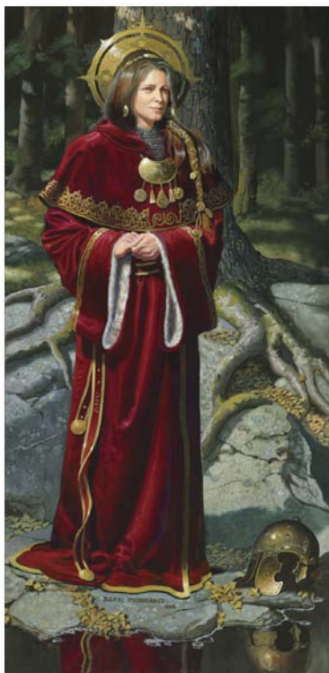
DANU OF THE CELTS Fine Art MasterWork™ Giclée Canvas: 50 s/n. 21" w x 42" h. $950