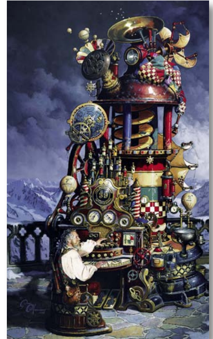
THE WEATHERMILL Fine Art Giclée Canvas: 75 s/n. 21" w x 35" h. $695 Low inventory Fine Art Print: 550 s/n. 16⅞" w x 26¾" h. $175 Low inventory