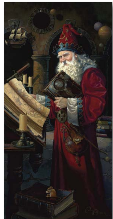
SOLARUS THE WIZARD Fine Art MasterWork™ Giclée Canvas: 50 s/n. 22" w x 44" h. $950 Fine Art Print: 450 s/n. 14" w x 28" h. $165

All artwork ©Dean Morrissey © The Greenwich Workshop, Inc. All rights reserved.