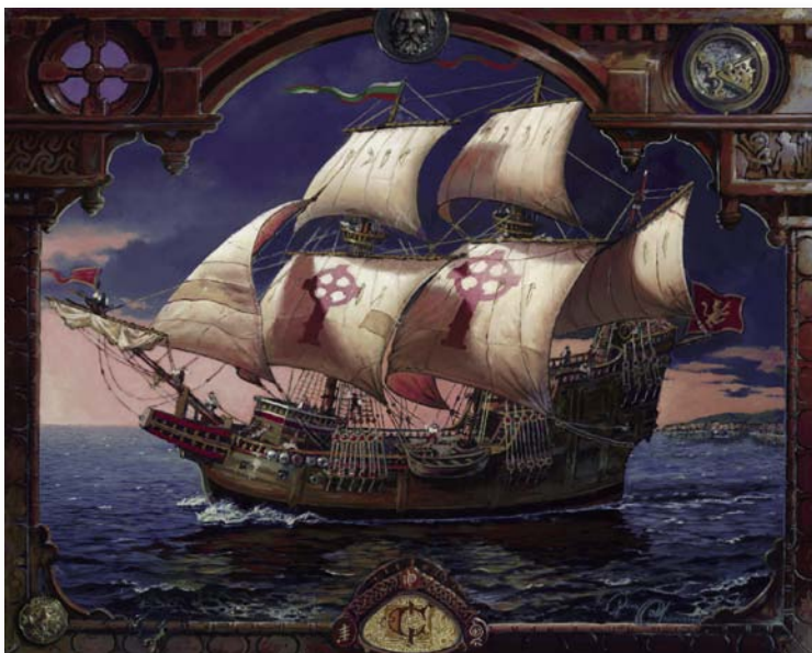
THE VOYAGE OF THE FIANA Fine Art Giclée Canvas: 150 s/n. 25" w x 20" h. $550