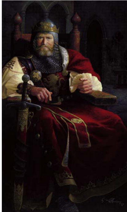
CELTIC KING Fine Art MasterWork™ Giclée Canvas: Sold Out at Publisher. Ask Your Dealer for Availability. Fine Art Print: 375 s/n. 12" w x 20" h. $150 Low inventory