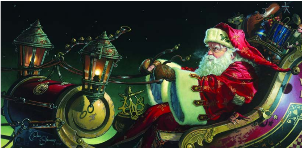
FATHER CHRISTMAS: THE SLEIGH RIDE Fine Art Giclée Canvas: Sold Out at Publisher. Ask Your Dealer for Availability. Fine Art Giclée Canvas: 450 s/n. 20" w x 10" h. $295