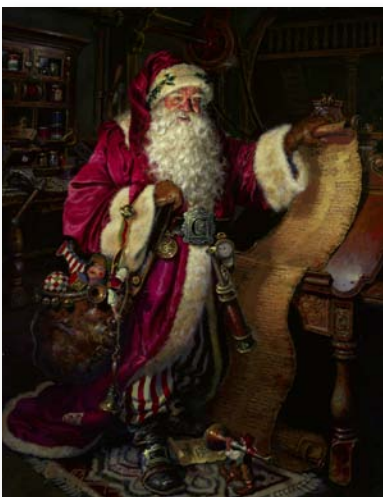
CHECKING IT TWICE Fine Art Giclée Canvas: Sold Out at Publisher. Ask Your Dealer for Availability. Fine Art Print: 550 s/n. 15" w x 20" h. $150 Low inventory