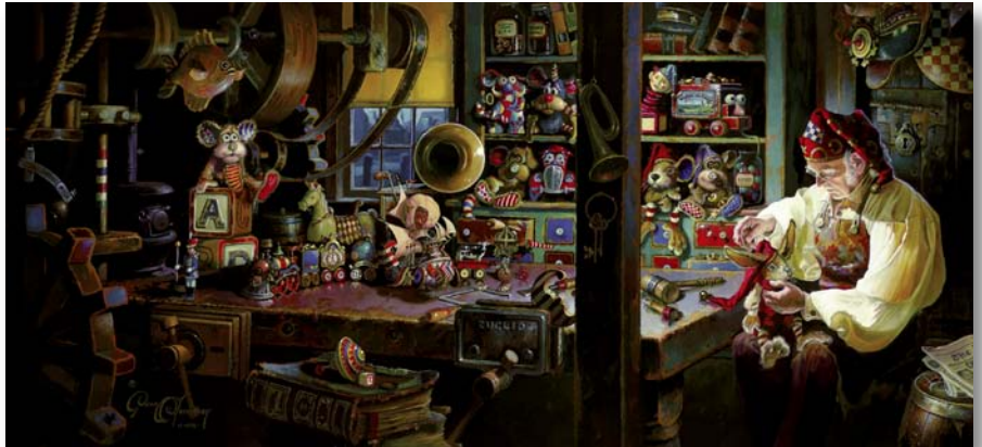
THE MAGIC DOOR Fine Art Giclée Canvas: 150 s/n. 40" w x 18" h. $795 Fine Art Print: 950 s/n. 31" w x 14 1/4" h. $175 Low inventory