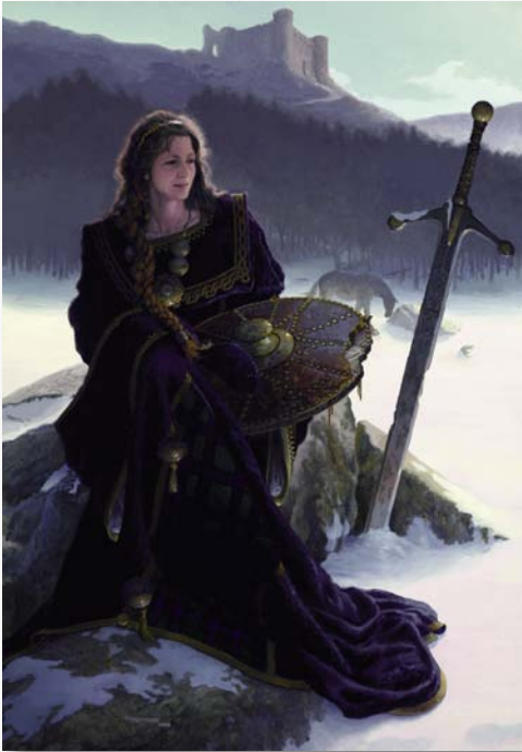
ANNA OF THE CELTS Fine Art Giclée Canvas: Sold Out at Publisher. Ask Your Dealer for Availability. Fine Art Print: 375 s/n. 13¾" w x 20" h. $150 Low inventory