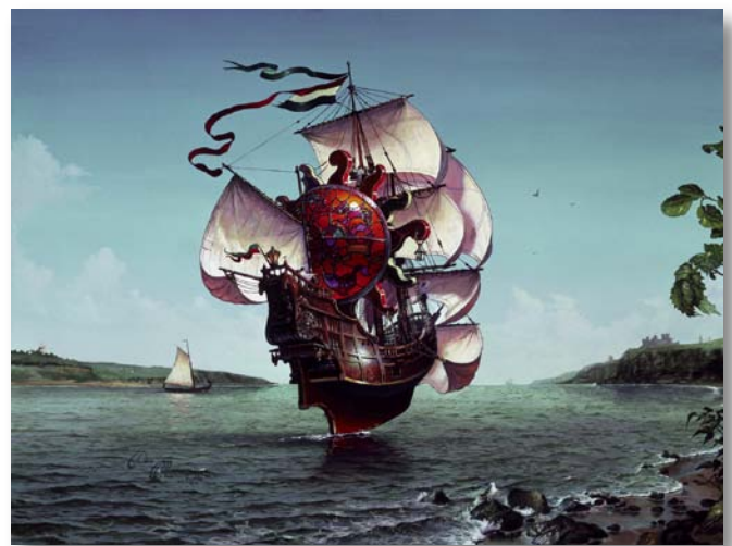
THE LIGHTSHIP Fine Art Giclée Canvas: 250 s/n. 18" w x 13" h. $325 Low inventory Fine Art Print: 550 s/n. 20" w x 15" h. $145