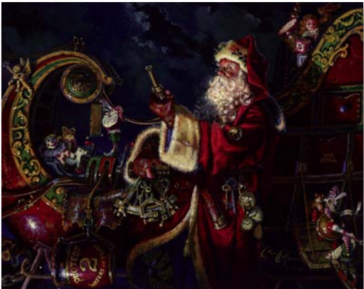
PREPARING FOR THE JOURNEY Fine Art Giclée Canvas: Sold Out at Publisher. Ask Your Dealer for Availability. Fine Art Print: 750 s/n. 19 1/2" w x 15 1/2" h. $135 Low inventory