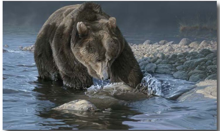
OVER THE RAINBOW Fine Art Giclée Canvas: limited to 100 s/n. 27" w x 17" h. $595