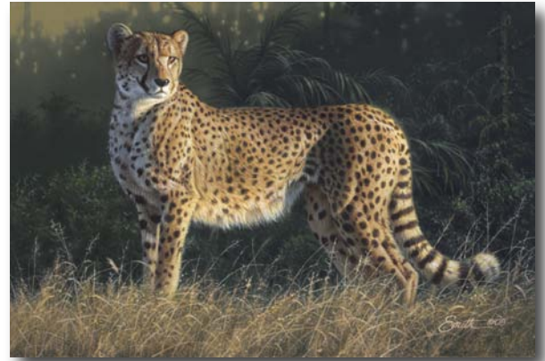
DUMA Fine Art SmallWorks™ Giclée Canvas: 100 s/n. 12" w x 8" h. $200