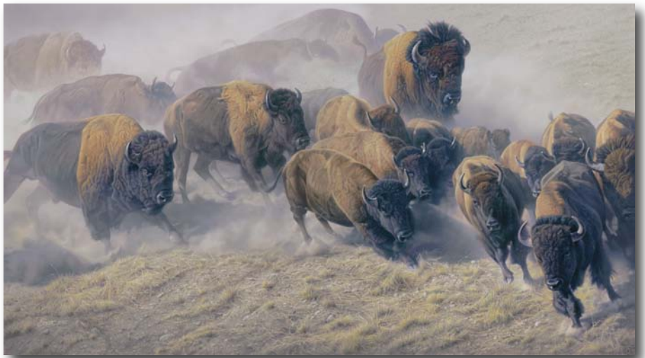
THUNDER AND DUST Fine Art MasterWork™ Giclée Canvas: Sold Out at Publisher. Ask Your Dealer for Availability.