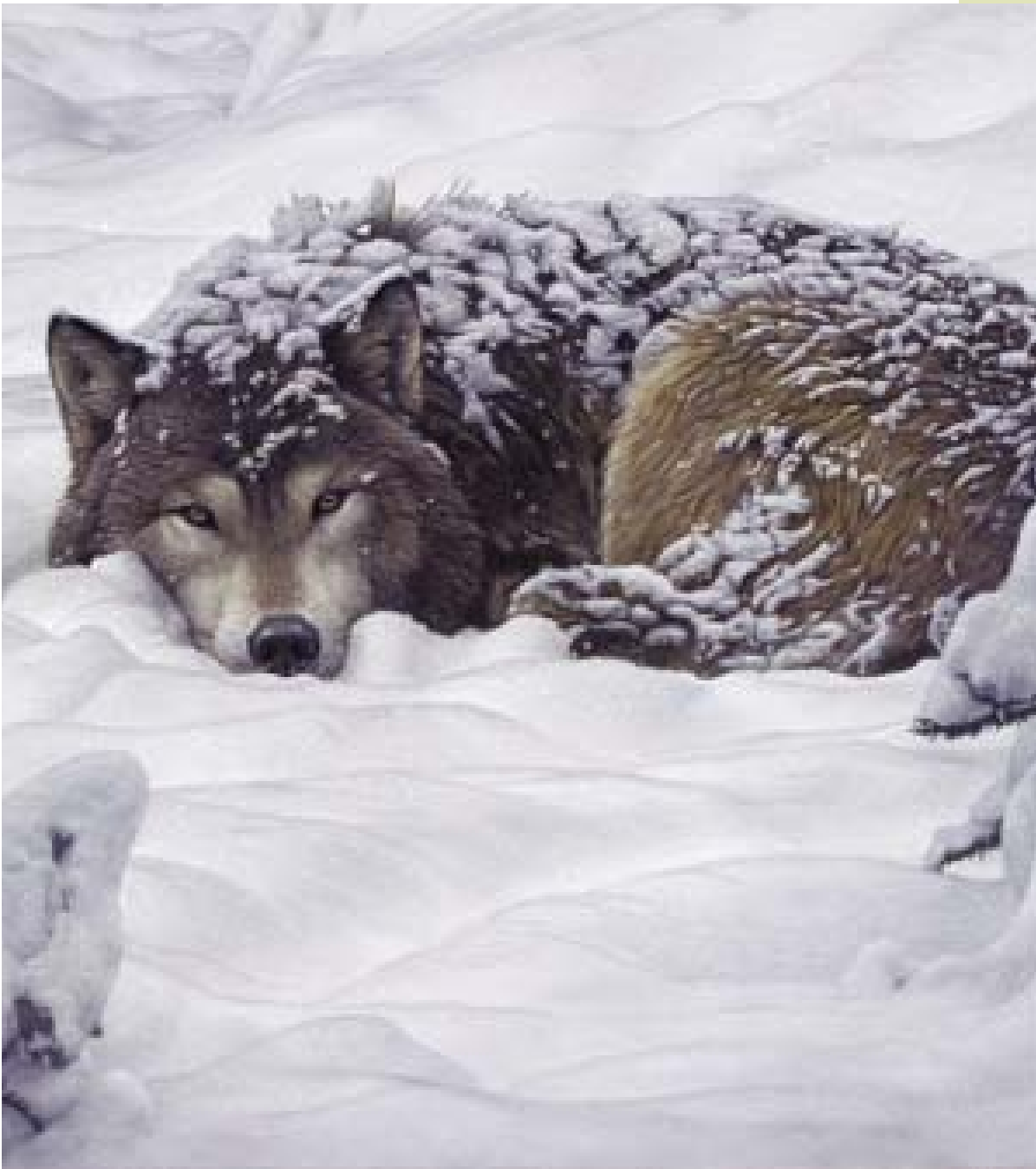
RIVERBANK REFLECTIONS (detail)