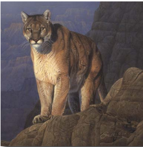
INTO THE SUN Fine Art SmallWorks™ Giclée Canvas: limited to 100 s/n. 10" w x 10" h. $210