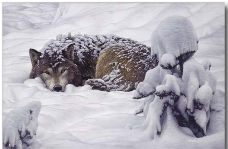
WINTER'S EMBRACE Fine Art Giclée Canvas: limited to 100 s/n. 24" w x 16" h. $595

All artwork © Daniel Smith © The Greenwich Workshop®, Inc.