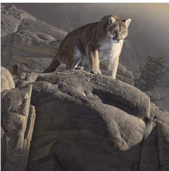
ON THE EDGE

Fine Art SmallWorks™ Giclée Canvas: Sold Out at Publisher. Ask Your Dealer for Availability.