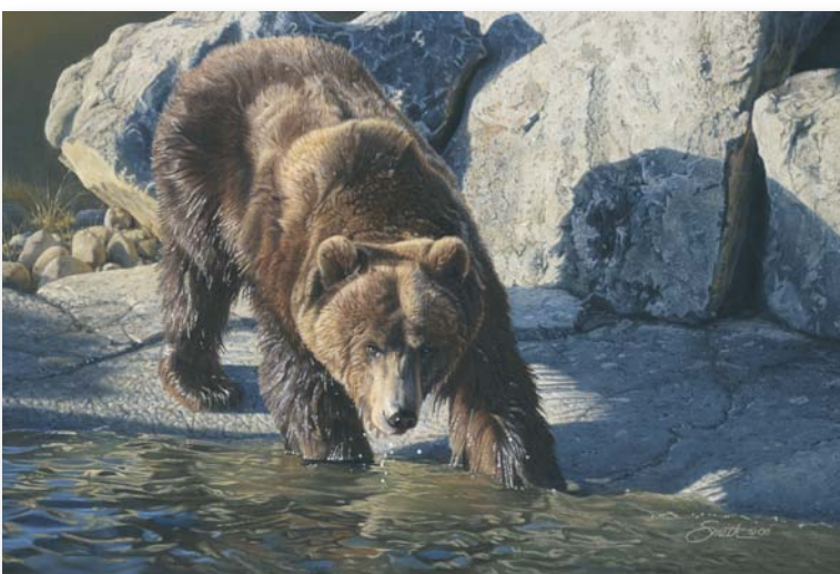
RETREAT FROM THE HEAT

Fine Art Giclée Canvas: limited to 200 s/n. 10" w x 9" h. $195