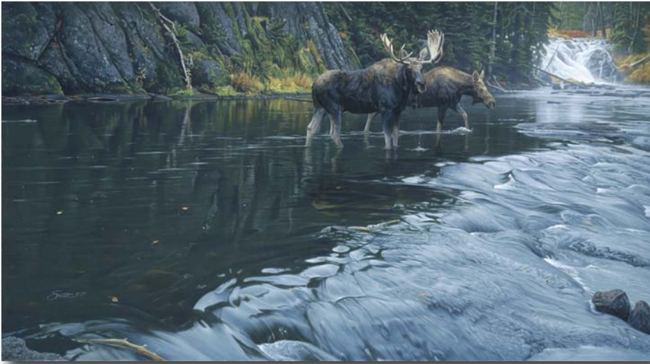
AUTUMN CASCADE Fine Art Giclée Canvas: limited to 100 s/n. 32" w x 18" h. $695