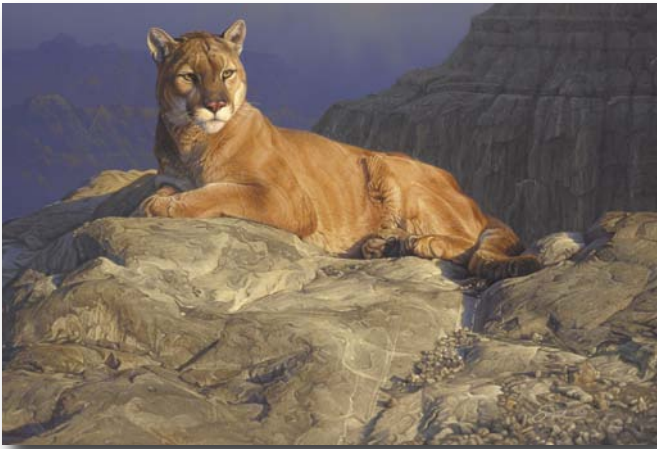
FLEETING SUN Fine Art Giclée Canvas: limited to 50 s/n. 24" w x 16" h. $595