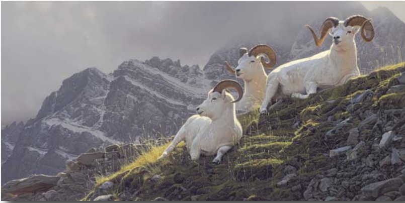
SUMMIT SANCTUARY Fine Art Giclée Canvas: limited to 75 s/n. 34" w x 17" h. $695