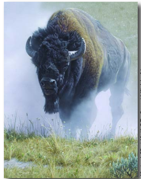
OUT OF THE DUST Fine Art SmallWorks™ Giclée Canvas: limited to 200 s/n. 9" w x 12" h. $225

All artwork © Daniel Smith © The Greenwich Workshop, Inc.