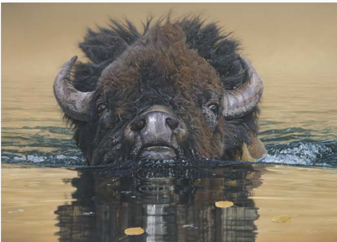
STILLWATER CROSSING Fine Art Giclée Canvas: limited to 50 s/n. 25" w x 18" h. $595 Low inventory Fine Art Giclée Print: limited to 100 s/n. 19 3/4" w x 14" h. $195