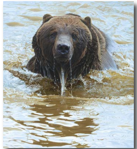
COOL RUNNINGS Fine Art Giclée Canvas: limited to 125 s/n. 18" w x 21" h. $595