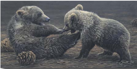
BRAWLIN' BRUINS Fine Art SmallWorks™ Giclée Canvas: limited to 100 s/n. 16" w x 8" h. $200