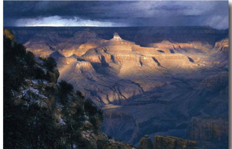
SUDDENLY AGLOW Fine Art MasterWork™ Giclée Canvas: 50 s/n. 54" w x 36" h. $2250