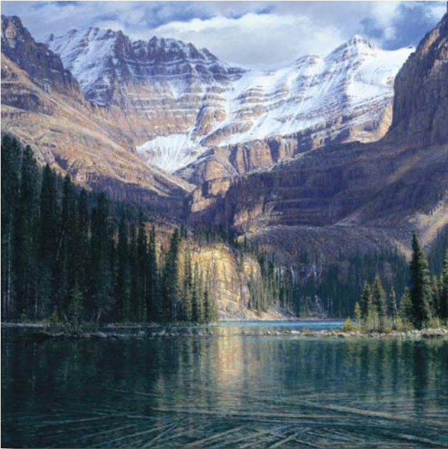
SEPTEMBER AFTERNOON AT LAKE O'HARA Fine Art MasterWork™ Giclée Canvas: 50 s/n. 37" w x 37" h. $1450