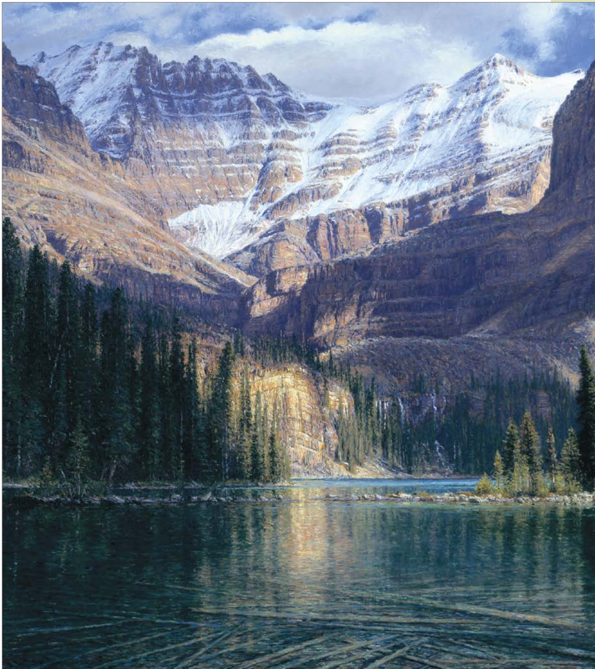
SEPTEMBER AFTERNOON AT LAKE O'HARA ( detail )

All artwork ©Curt Walters ©The Greenwich Workshop, Inc.